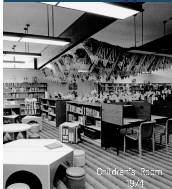
Children's Room 1974