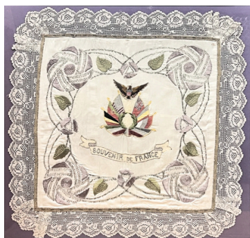
French Souvenir Handkerchief

Monday, March 3rd - Friday, March 28th Reception Thursday, March 20th 4:00-6:00pm